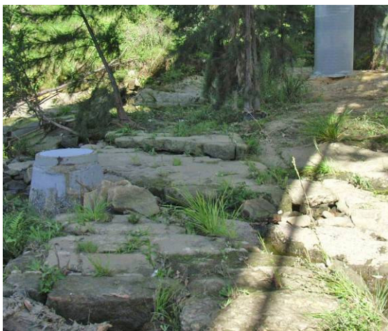
Above: Remains of Devlins Creek Crossing, Epping Cover: View along wall of wharf remains at Bedlam Point to Abbotsford

The Convict Trail includes the Great North Road, the surrounding land, and historic buildings. The Convict Trail Project Inc. (CTP) is a community based organisation devoted to caring for, protecting and promoting the Great North Road.